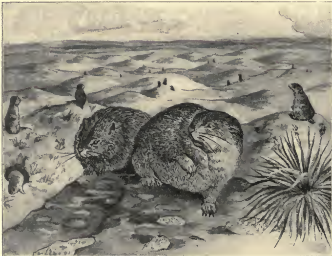
FIG. XXIX. CYNOMYS LUDOVICIANUS. PRAIRIE-DOG.